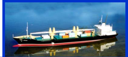
Iron York—Iron Arnhem Australian Cargo Ship L.O.A.: 1260mm Beam: 195mm Scale: 1/96