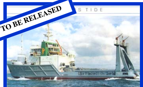
Flinders Tide Anchor Handling Tug L.O.A.: 1400mm Beam: 325mm Scale: 1/35