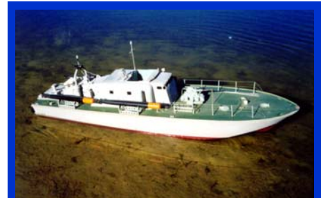
Perkasa Patrol Boat L.O.A.: 1630mm Beam: 450mm Scale: 1/17