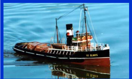
St. Class Sydney Harbour Tug L.O.A.: 1345mm Beam: 275mm Scale: 1/25