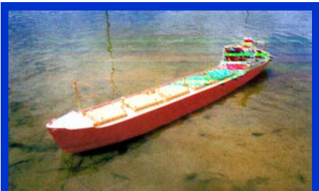
Lake Macquarie Cargo Ship L.O.A.: 1410mm Beam: 175mm Scale: 1/100