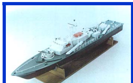
Jaguar Class German Patrol Boat L.O.A.: 960mm Beam: 175mm Scale: 1/48