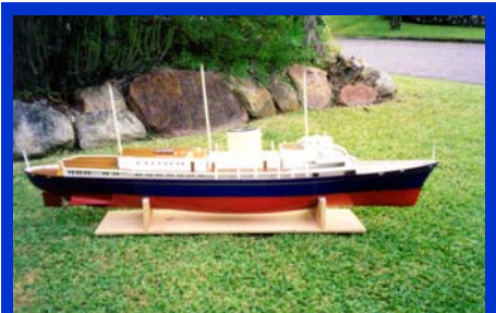
Royal Tacht Britannia L.O.A.: 1200mm Beam: 155mm Scale: 1/100